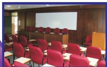
Audio Visual Room